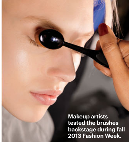
Makeup artists tested the brushes backstage during fall 2013 Fashion Week.